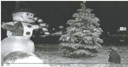
Tree Lighting with the In Memory Decorations

Hyde Park Lions were busy during December with a Christmas Wreath Sale which profited $1500; the cord of wood raffle that netted $525. 70 children were in attendance at the Holiday Theatre Party; $715 was donated for the Adopt A Family chosen; and the Memory Tree was decorated with Memory ornaments