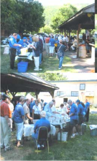
Greenwood Lake Lions at their BBQ on Sept. 11 th

Hudson Lions were pleased with the $623 raised in their 50/50 raffle at the Greenport Community Day. Speakers at the club's upcoming meetings are concerned with the Hudson Area Library, the Sportsman's Federation on Hunters for Hunger, Hospice, Long Term Health Care and the Sight Society of Northeastern New York.