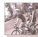
Riding Tandem Bikes