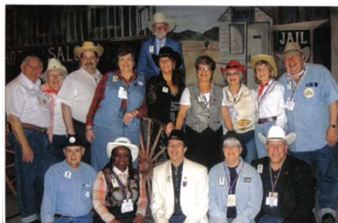
8 PDG's from 2005-2006 Multiple with their Council Chair What a crew of Cowboys and Cowgirls