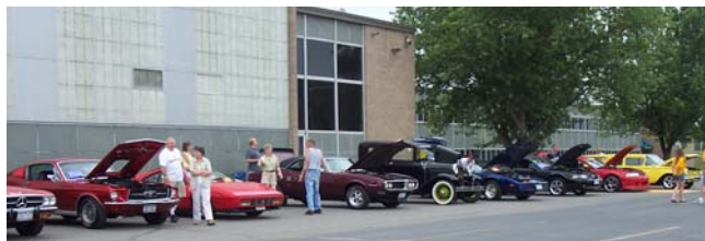
Some cars arrive early to pick out their favorite spot.