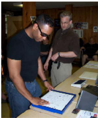
Learning to use the TTT – Talking Tactile Tablet to read maps

At VISIONS Employment and Technology Institute at VCB, Participants use computer technology to search for jobs