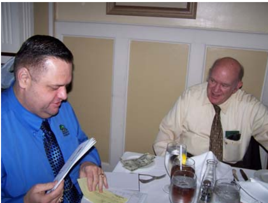
Monroe Lions are plan to attend the MD20 Lions Convention in Binghamton May 22 - 24.