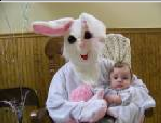
Left: A visit with the Easter Bunny is part of breakfast with the Town of Deer Park Lions Club