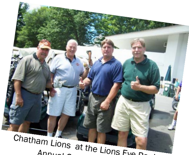
Chatham Lions at the Lions Eye Bank Annual Golf Tournament