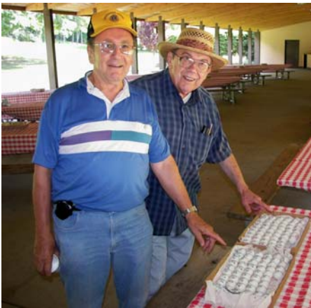
Yup...all 100 balls are present Let's hurry up and draw a winner!