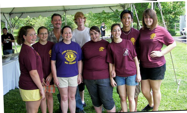
Members of the TOWMO Lions joined the Town of Wallkill LEOs at Guiding Eyes for the Blind