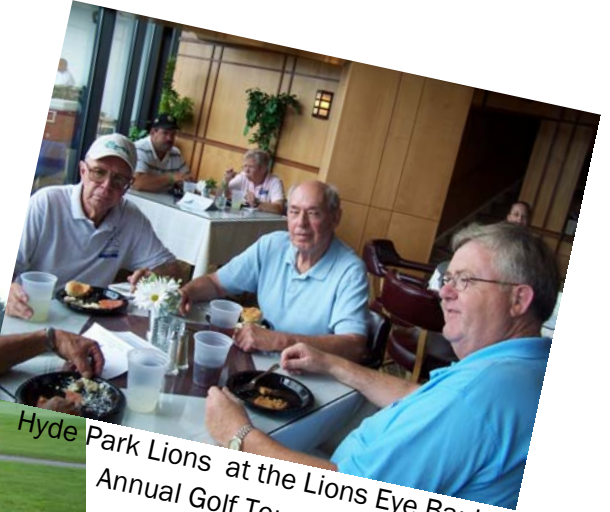
Hyde Park Lions at the Lions Eye Bank Annual Golf Tournament