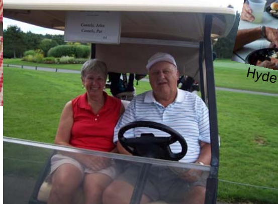
Town of Dover Lions at the Lions Eye Bank Annual Golf Tournament