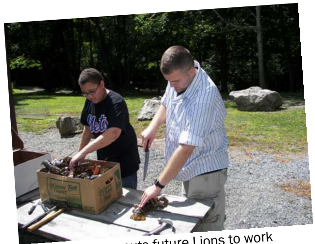
LaGrange puts future Lions to work preparing the lobsters