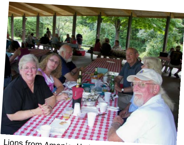
Lions from Amenia, Hyde Park and Rhinebeck enjoy the LaGrange Lions Lobster Bake