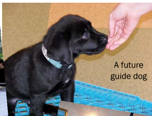
A future guide dog