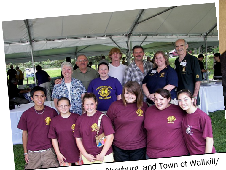
Hyde Park, LaGrange, Newburg, and Town of Walkkill/Mid-Orange Lions joined the Town Of Walkkill Leos at Guiding Eyes for the Blind (not pictured but present were representatives from Mamakating Lions, Mamakating LEOs, and Town of Dover Lions)