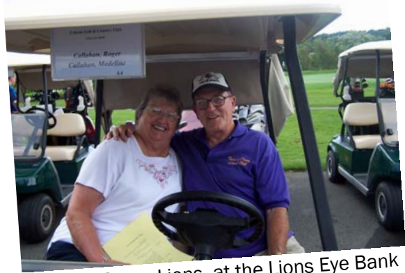
Town of Dover Lions at the Lions Eye Bank Annual Golf Tournament