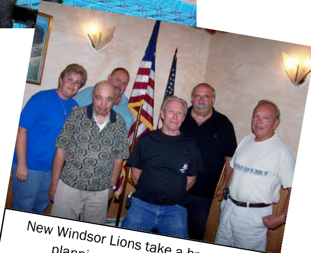
New Windsor Lions take a break from planning the next fundraiser