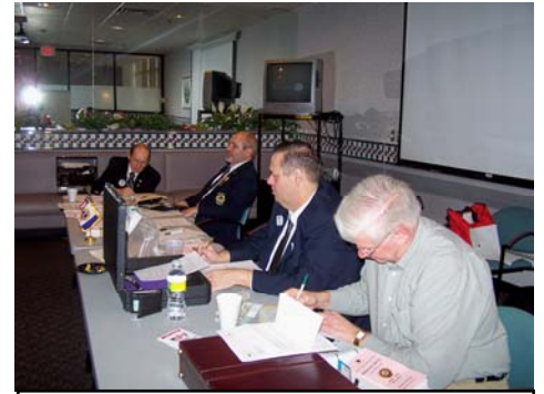
District Cabinet Meeting