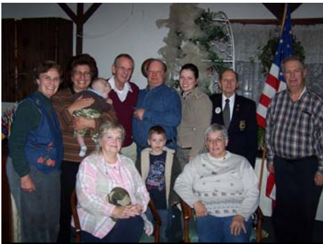
Town of Deepark Lions welcome younger family members at meetings