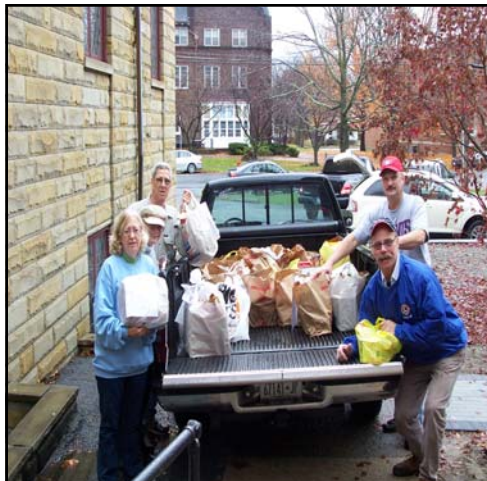
Goshen Lions Food Drive