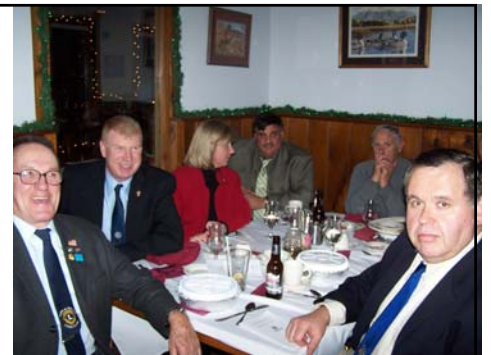
Representatives of 14 Clubs in Dutchess County joined together at Copperfields in Pleasant Valley for the annual "President's Night" sponsored jointly by the Dutchess County Lions Sight Restoration Committee and the Dutchess County Lions Hearing Preservation Committee.