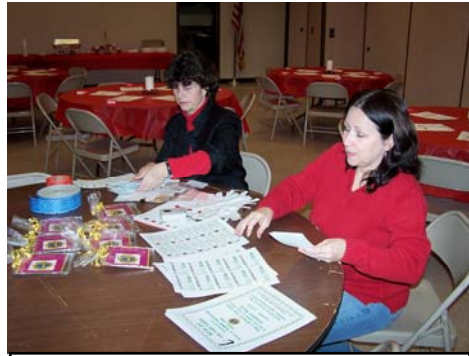
Town of Wallkill/Mid-Orange Lions prep raffle tickets at Valentines party