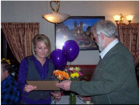
Livingston Manor art teacher is recognized for her role in the Peace Poster Contest