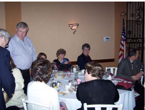
Hyde Park Lions invite friends and past members to the Annual Awards Dinner