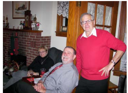
There's no place like home, whether it's a Holiday Party or a Club Board Meeting.