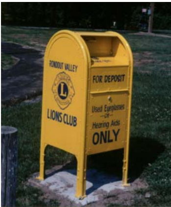
Rondout Valley Lions Club Eyeglass Collection Box