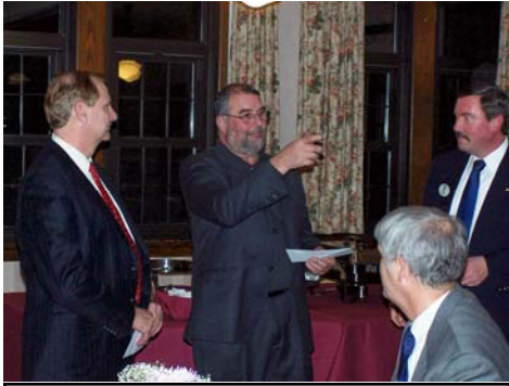
Presidents of LaGrange & Pleasant Valley present a check to The Children's Homee