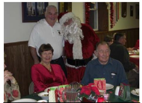
Santa drops in to visit at the Millbrook Lions Holiday Dinner for Local Seniors