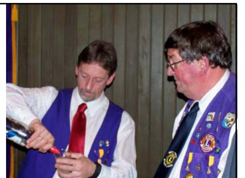
Amenia Lions know that serving dinner for 350 requires organization, planning, and a good crew!