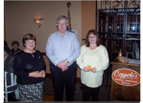
Hyde Park Lions Annual Awards Night