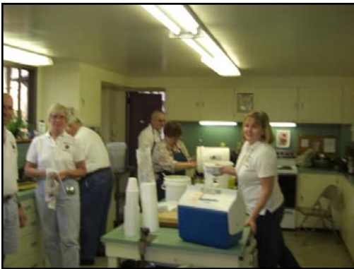
Millbrook Lions work crew prepares for Soup Sunday