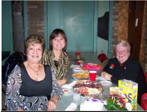
Friendship, Fellowship, and Fun The Amenia 300-Club