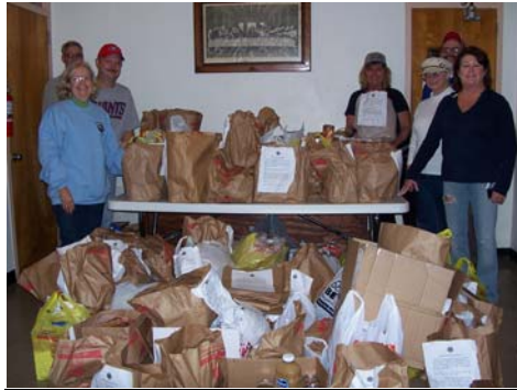
Goshen Lions collected almost 300 bags of groceries at a food drive