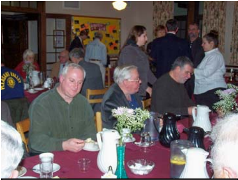
Pleasant Valley Lions and LaGrange Lions find joint meetings informative and fun