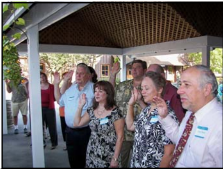
Proud newly inducted members of the Greater Washingtonville Lions Club