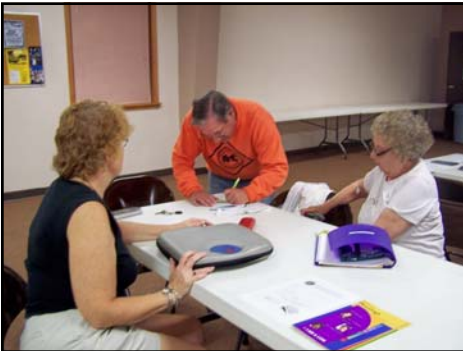
Orisville Lions prepare for the Annual Country Fair