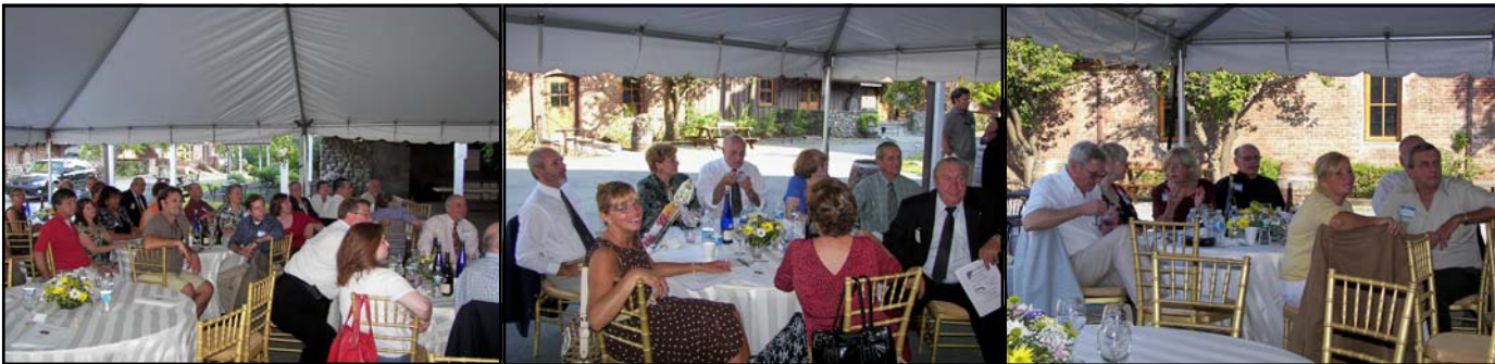
A perfect day, great wine, lots of old and new friends. In fact, let's all go back again on June 6, 2009. Save the date!