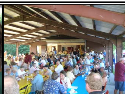
A huge crowd of supporters turns out for the "Annual Pine Plains Lions Club All You Can Eat Beef BBQ".