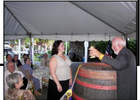
Professional Advice for the New Tail Twister