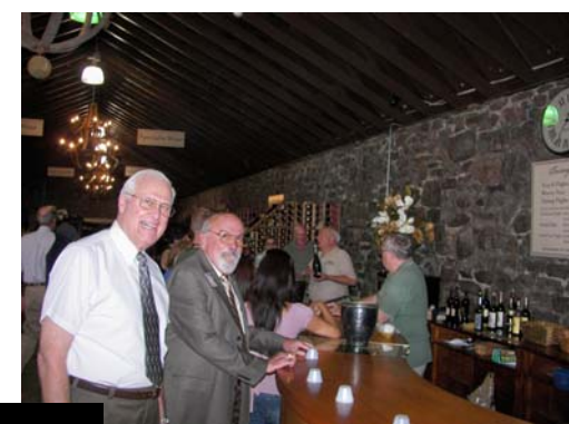
On the grounds of the Brotherhood Winery August 24, 2008